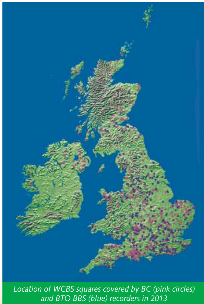
Location of WCBS squares covered by BC (pink circles) and BTO BBS (blue) recorders in 2013

The time series includes 320 squares sampled in each of the five years of the WCBS. It is especially valuable if as many as possible of these 'long-running' squares are walked again in 2014 and beyond. We will be using the data to compare trends in the wider countryside with those from UKBMS transect sites. A summary of these results will be made available in the 2014 UKBMS Report.